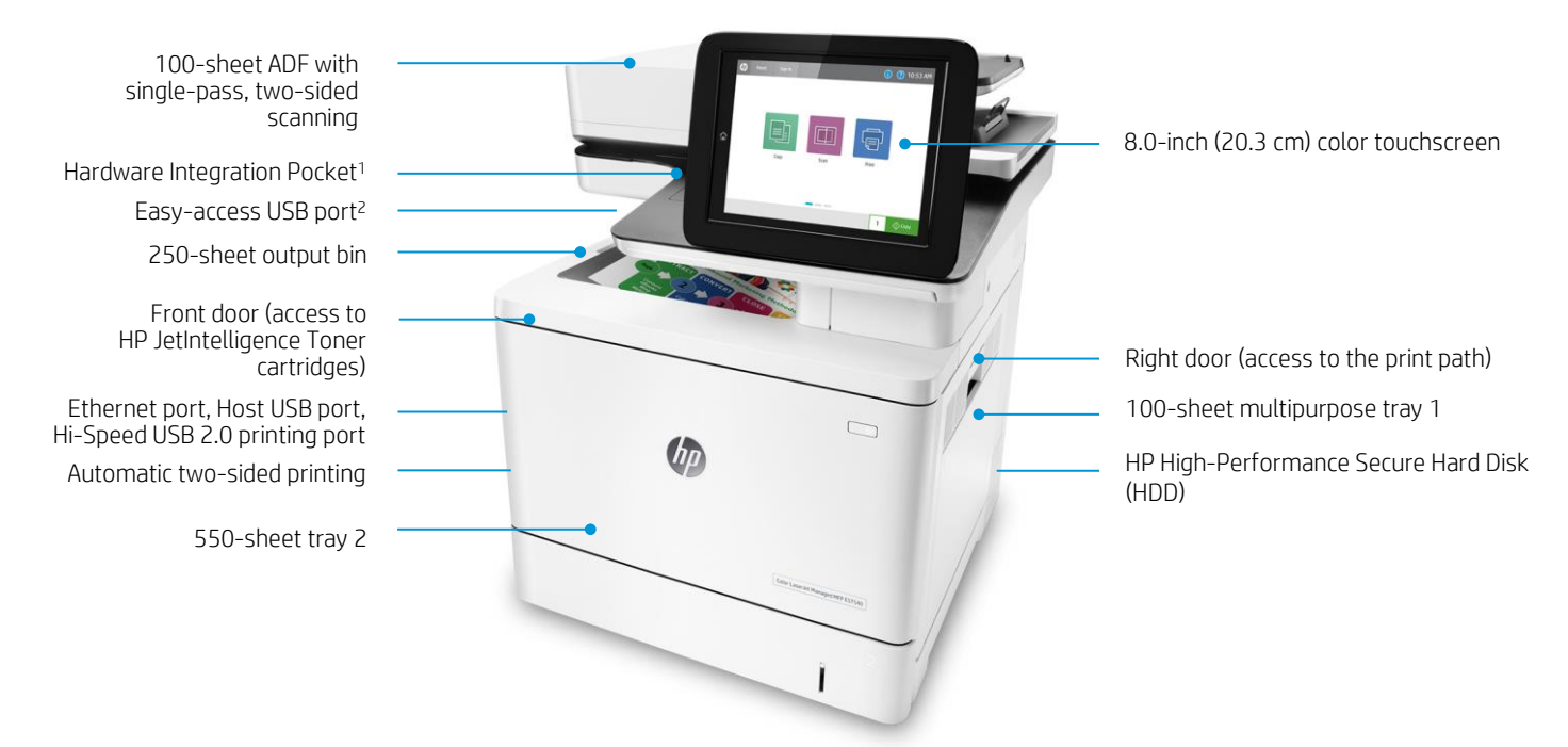
HP Color LaserJet Managed Flow MFP E57540dn