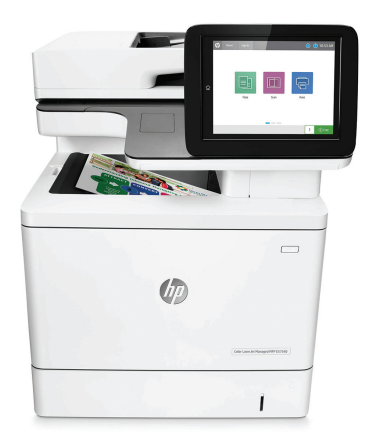
HP Color LaserJet Managed MFP

Ideal for enterprises and medium businesses that need a secure, highly productive, energy-efficient color MFP.