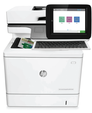
HP Color LaserJet Managed Flow MFP E57540c